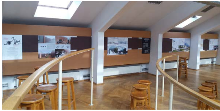
Figure 1: Post-competition exhibition in the Department of Drawing, Painting and Sculpture, St Luke's Academy, May 2018.